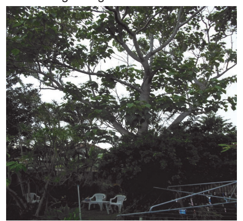
The Pawlownia tree from the back balcony – the Hill's hoist gives the perspective!

One more thing before we move to the community garden - the Paulownia tree (also known as the "Princess" or "Empress" tree). This is Judy's favourite "plant" in her garden. I would estimate it is now 40 feet tall: it provides shade: it creates leaf litter for the compost bin; and the birds and bees love it. The Paulownia tree has been grown in China for over 2,000 years. Apparently over 2.5 million hectares of Chinese land are planted with these trees, which are used as shelter crops. firewood and general timber. In Japan they use the timber for furniture, as it is extremely light, and actually guite hollow inside. Judy had a branch as a sample – it was some 3 metres long, and it was very easy to lift. The Paulownia tree is recorded as being one of the fastest growing trees in the world.