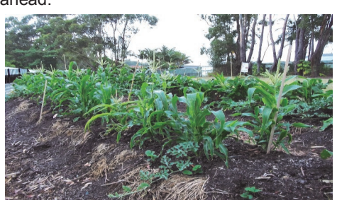
The vege patch at Ashmore State School – very impressive!

In conjunction with Gold Coast Permaculture and a number of volunteers, there are now four long garden beds filled with sweet corn. melons of several varieties, silver beet, strawberries, lettuces and various flowers and herbs. The beds were formed with the no-dia system of cardboard, compost and hay, and the children are learning how to plant, water and weed a garden. There are also citrus trees planted around the perimeter of the garden area, and the zucchini plants that are planted under several of the citrus are producing well. I asked Judy what are the plans for the future - there is still quite a lot of land available around the gardens that can be planted out, so I think her Tuesday visits to the school will be busy for guite some time ahead.