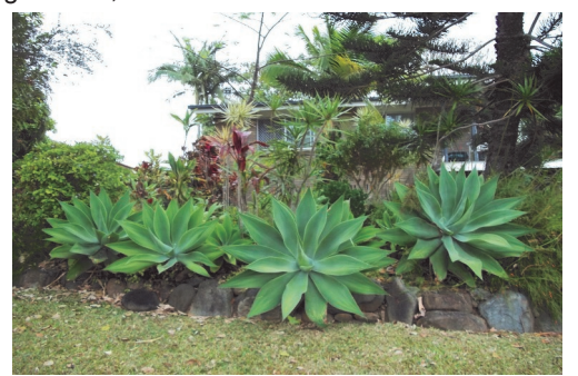
The healthiest – and largest - agave plants I've ever seen!

November 2013: I drive around the corner into the street where Judy Reiser lives, instantly recognize the block as belonging to a gardener, and think "Wow"!