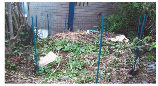
The "experimental" compost area – the goal is a cubic metre of material

To feed the soil, Judy has used "anything that can be composted". Recently, she has been provided with plenty of horse manure to add to the mix - this includes an amount of sawdust, so we had a discussion about how to get it to break down effectively in the compost bins. Judy is experimenting with compost bins at the moment - she is working two "black" bins (and moves the material from one to the other to aerate it), but she realizes that the material does not reach high enough temperatures to kill weed seeds. So she has started a new compost area – aiming for 1 x cubic meter, but a bit more material is required as vet. Also she has a long-term compost area in which leaf litter is put - she knows that will be usable in a year or two.