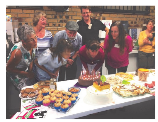
Just some of our hard working Committee