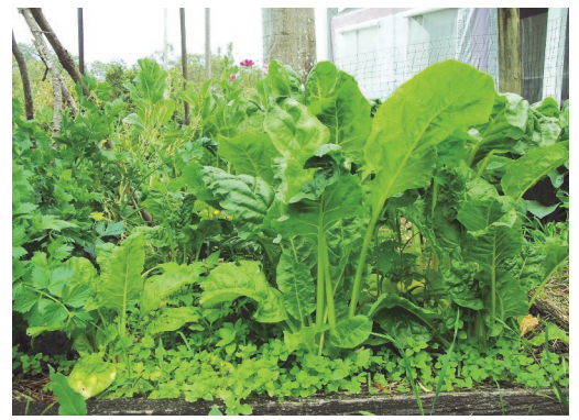
Have a look at the coloured photo on the website, and the difference will become very obvious!

However, I didn't realize how much the tall celery plants to the north of the garden bed would over-shadow the two silver-beet plants on the left. So I took a picture (well worth a thousand words) to remind me that all my vegetables need plenty of sunlight!