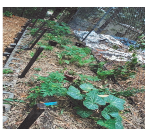
3 months later

I'm sure all "professional home gardeners" probably don't need to do this but for me, recording everything made it easy and I have been able to refer to my Excel spread sheet and notes although I am finding now that the information is starting to sink in and I am having to look at my notes less.